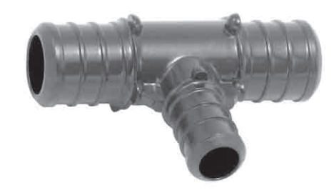
WP18P CrimpRing™ Tee