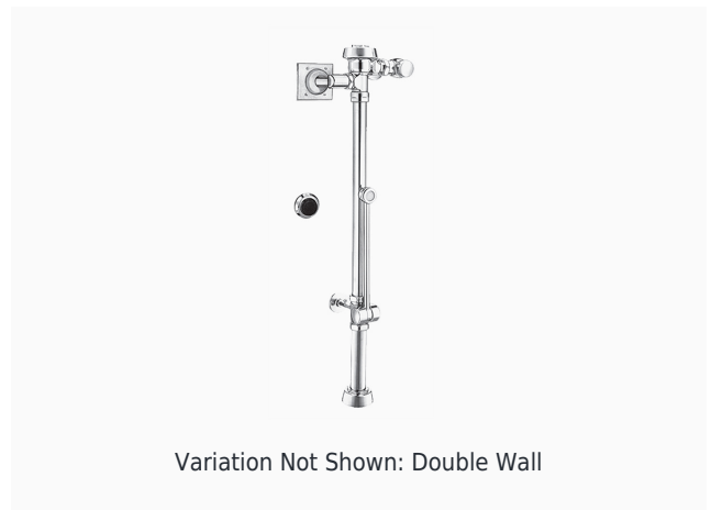
Variation Not Shown: Double Wall