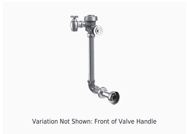
Variation Not Shown: Front of Valve Handle