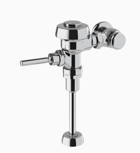
Variation Not Shown: 1" Flush Connection