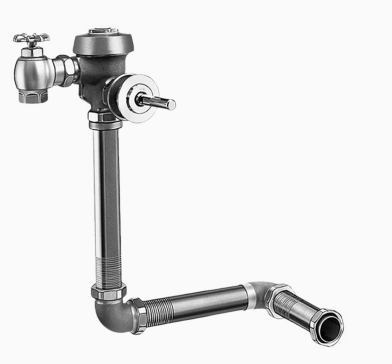
Variation Not Shown: Double Wall