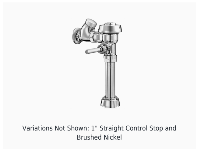
Variations Not Shown: 1" Straight Control Stop and Brushed Nickel