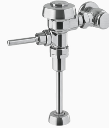
Variation Not Shown: Brushed Stainless