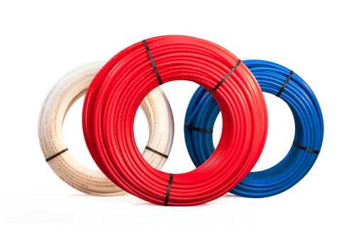
Pictured: HyperPure® Coils