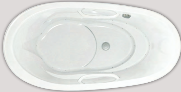
ESSENCIA OVAL 7236 (FREESTANDING)